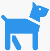
● Apartments that accept ALL dogs ● Apartments that do not accept ALL dogs